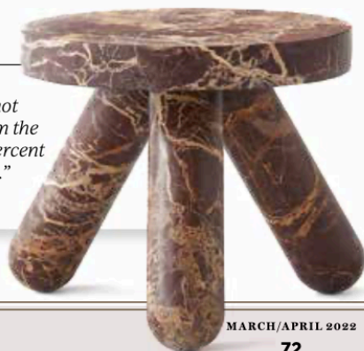
"JAXX" STOOL ($499/CB2) »