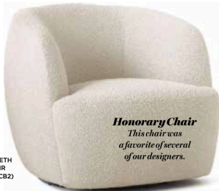
Honorary Chair This chair was a favorite of several of our designers.