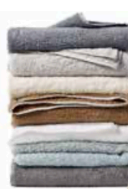
"CLOUD LOOM" TOWELS (FROM $18/COYUCHI) »

ONE-CHANCE PURCHASES "If you fall in love with something on vacation, buy it on the spot. You'll regret passing it up if you return the next day and it's gone." —Bryan Yates, Yates Desygn